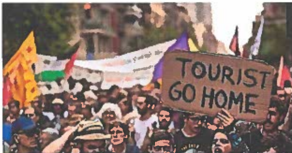
'The Demand Is Unstoppable': Can Barcelona Survive Mass Tourism? (Gift Article) nytimes.com

It IS possible to go too far in bringing in tourists. I offer you this article as proof.